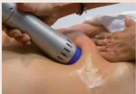
Z Wave treatment after CoolSculpting ®

"Our 2016 CoolSculpting ® revenue was the best we had for the past few years. In spite of increasing CoolSculpt competition in the area, our business more than doubled from 2015 to 2016 since we added Z Wave. It was Z Wave that helped us stand out with a competitive advantage in our marketplace."