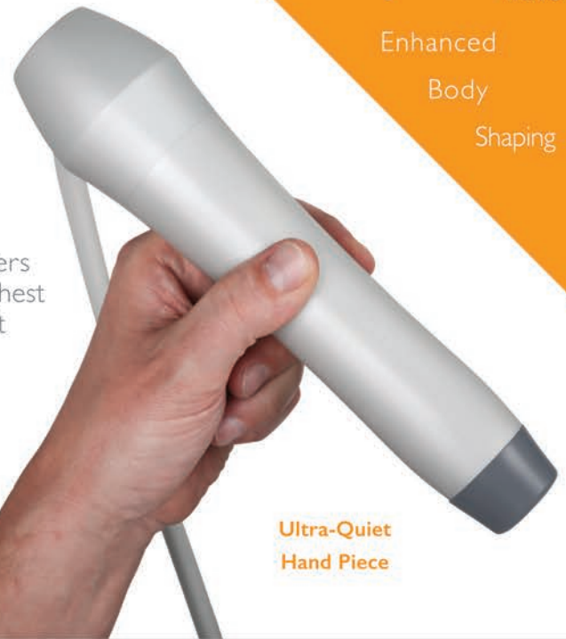
Ultra-Quiet Hand Piece

Contact us to find out about our introductory offers and upgrade specials.