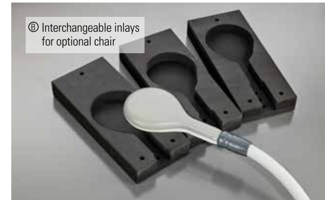
Ⓑ Interchangeable inlays for optional chair