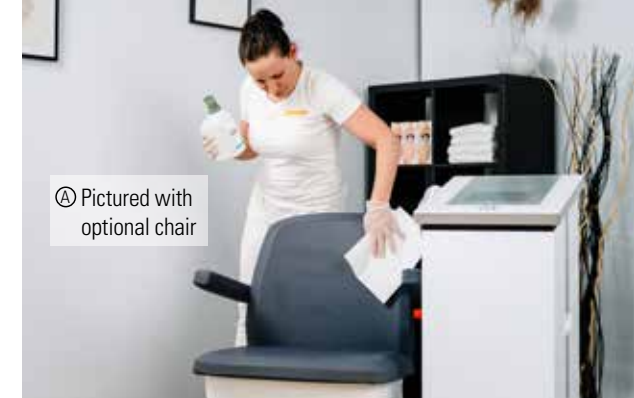
Ⓐ Pictured with optional chair